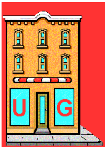
User Group Store www.ugr.com

“I strongly recommend True Image to our members. Inexpensive but worth it’s weight in platinum if your hard drive crashes.”- Jim