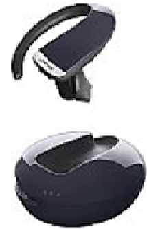
Jabra STONE2 Bluetooth wireless headset