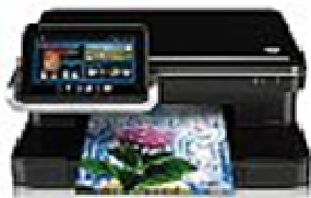
HP Photosmart eStation \ All-in-One Printer C510

Read this, and all of Lou's columns, @ Oceanic Around Town. Visit http://tinyurl.com/363qew