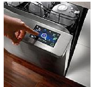
Kenmore Elite® Color LCD Controls

“Watch TV, browse the internet, or do both at the same time on the same screen. Plus, finding your favorite content is a breeze thanks to the included, intuitive handheld keypad with mouse.”