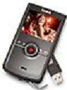
KODAK Zi8 Pocket Video Camera

B y the time you read this, I should be in Las Vegas for the annual Consumer Electronics Show (CES) where oohs and aaahs are regularly heard as thousands of new electronic goodies are unveiled. So, to tweak your curiosity about all this, I have listed a handful of new products that have been chosen as Innovation Award winners that I will, hopefully, see in person while I'm at the show. The Innovations Design and Engineering Awards program, sponsored by PCWorld, recognizes the most innovative consumer electronics (CE) products in the industry's hottest product categories. Innovations has become a hallmark for the best designed products in consumer technology.