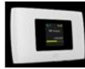
Portable Wi-Fi hotspot

Wireless internet connectivity is an important tool for college students, so arm them with their own personal wifi hotspot to connect their iPad, laptop or other device to the internet wherever they may be. Check with your cell phone provider for availability and monthly rates.