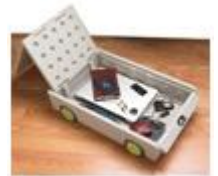
ECR4Kids Lock and Roll Portable Under-Bed Personal Safe

The low profile, locking, mobile storage container from ECR4Kids is perfect for protecting your valuables with ease and efficiency. It's great for college students who need to lock up their laptop, tablet computer, passport, wallet, and any other valuable items. This storage is also ideal for vacation homes, boats, or RV's. Simply place valuables in the container, lock the lid, and roll it under any standard bed frame. The ECR4Kids Lock and Roll includes a wire-braided security cable to secure to the bed frame or other fixed posts.