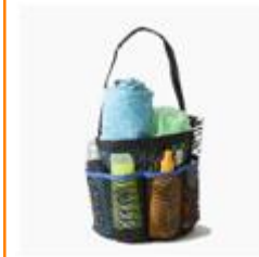
The Secret to a Hassle Free Shower

Are you fed up with putting your hand into a slimy plastic bag to find your comb, razor, or even worse your toothbrush? Do you have black mold spots all over your expensive beauty or hair products? Does your wash sponge or scrunchie have a sinister odor because it never dried out from the last time you used it? With the ShowerMade Shower Bag you can be fresh and organized every day.