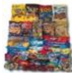
AtHomePlus Care Packages

They can be used as cool gifts for student care packages, dorm room snacks, college gift ideas, gifts for college students, gift ideas for college girls, care packages for troops, military care package, gift ideas for men, care packages for women, care packages for men, finals care package, gifts for men, and other care package box.