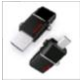
SanDisk Ultra Dual USB Drive

It's that time of year when the kids leave (or have left) the nest for a new life as a college student. After all the obvious "goodies" what else might your kids/grandkids really appreciate for their new venue? Tech stuff of course...but don't forget a couple "practical" items too... so, here are a half-dozen ideas for you to consider as you reluctantly wave goodbye!